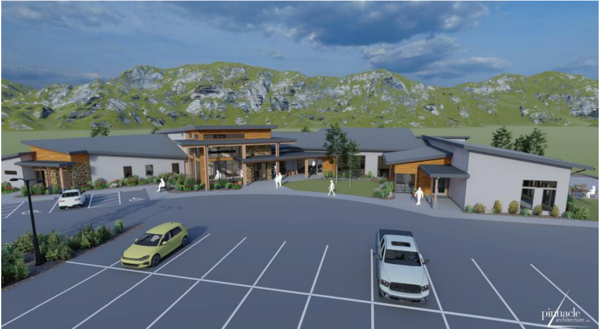
Front entry rendering